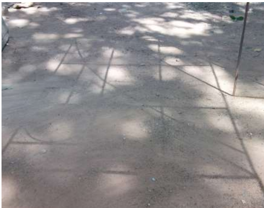
Figure 5. Brain Cell (2010).