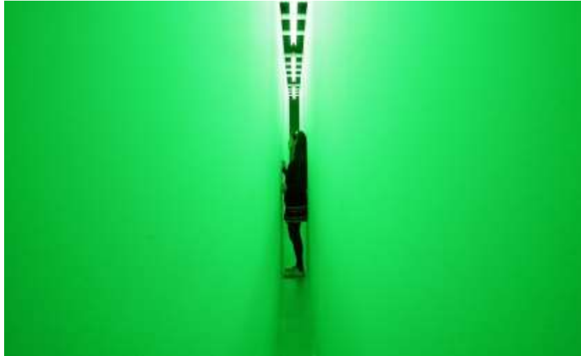
Figure 2. Bruce Nauman Green Light Corridor. Hayward Gallery 1970.