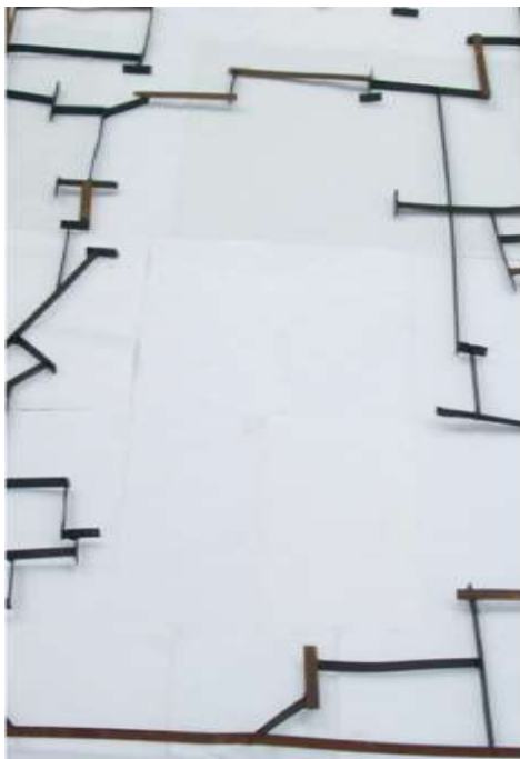
Figure 3. Anthill (2009).

users were considered. In Entangled Spaces (2009) Donkor explores the subject of chaos that stems from overcrowding and crowd mobility failures. In these scenarios, there are series of different configurations of private/public and personal/shared spatial complexities thrown together, and using these GPS/GPRS forms in their multitudes, representative of conventional plinth spaces in classical/modern sculpture thrown together, a new spatial representations emerge. Here, individual