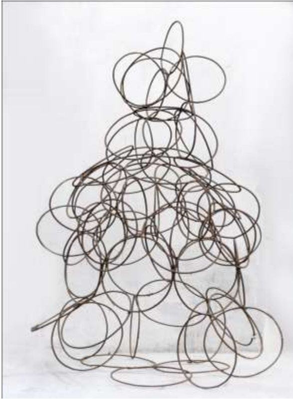
Figure 1. Experiment: Entangled Spaces (2009).

over-crowded if compared with a number of private institutions locally. The situation is not different in the secondary and tertiary levels, where facilities that held tens in the 1960s and 70s are holding multiples of hundreds. With doctor-patient of 1 doctor to over 6,000 patients on the average, and 1 doctor to between 29,000 and 44,000 to 93,000 patients in some places (The Chronicle 2013), in limited health facilities, doctors and patients are crowded out. Land area usages are also under pressure with most farmlands on the urban peripheries turning into residential zones and hybridized industrial/residential/commercial enclaves.